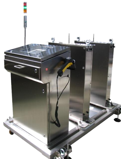
ARCHIMEDES II 9102 WiFi

It is a mobile system, mounted on wheels, hence it's easy to handle and versatile in all the different types of applications and of locations where its deployment is requested. The system is composed of a base structure with an installed control console, and two vertical detection units facing the measurement area where the bags are loaded. The system elements are protected by 3 mm of stainless steel.